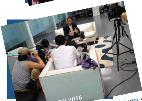
ADSHARE, JULY 2016