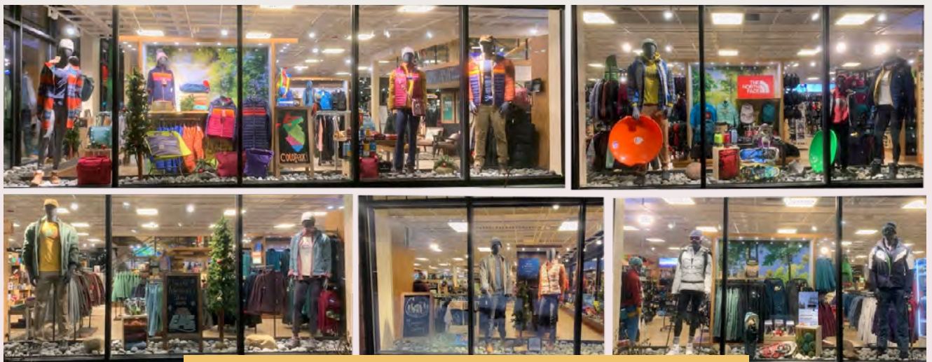
Storefronts, Eastern Mountain Sports