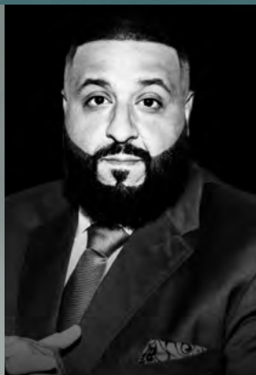
DJ KHALED, PRODUCER, SONGWRITER, RECORD EXECUTIVE

▶▶▶ “The demand for music from Africa and other developing regions is growing, and these professional creatives deserve to be a part of the international music marketplace. There is a need for them to have open access to global publishing and distribution options that protect their rights and ensure they're fairly paid. This initiative with Sound Royalties not only introduces and launches new talent, but helps creatives around the world thrive in their careers.”