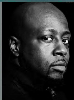
WYCLEF JEAN, ARTIST, SONGWRITER, PRODUCER