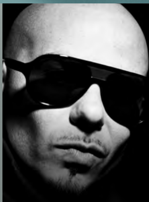
PITBULL, PERFORMING ARTIST, RAPPER